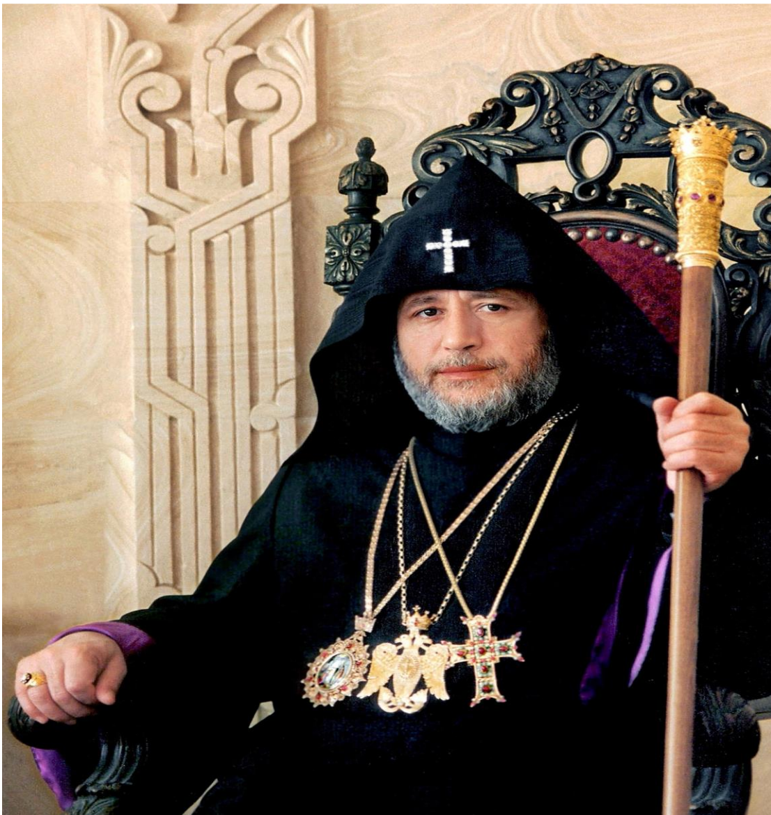
Consecration – St. Nerses Shnorhali Armenian Apostolic Church