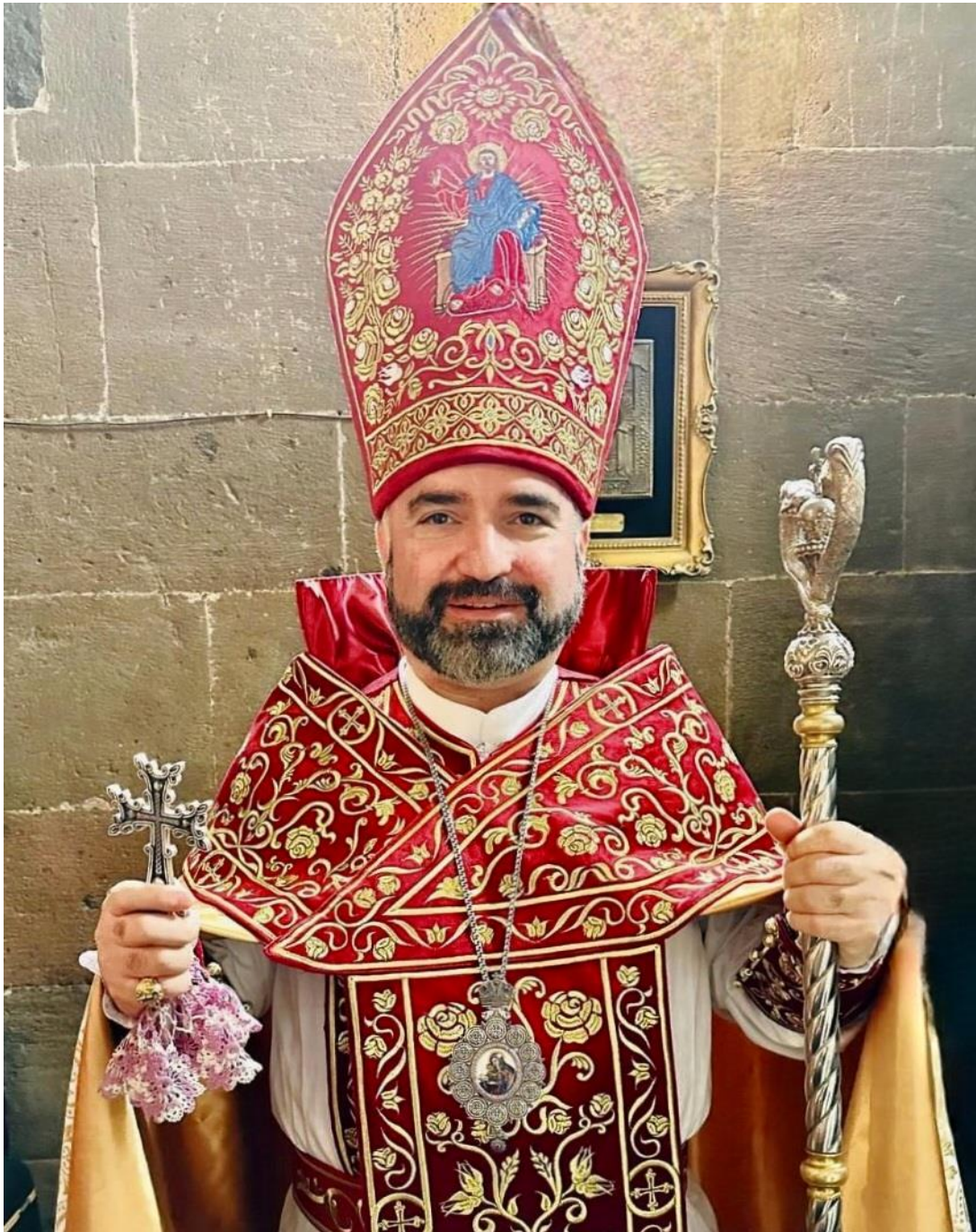
Consecration – St. Nerses Shnorhali Armenian Apostolic Church